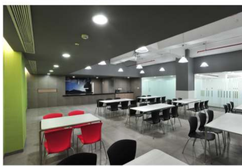
Bloom energy Mumbai