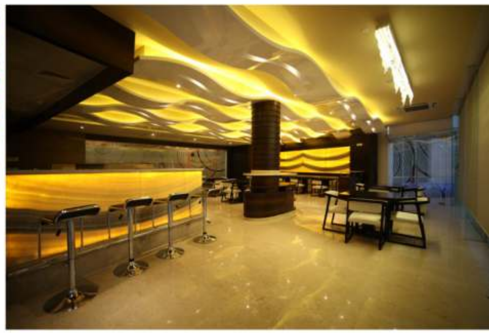
Raheja Vivera (Club house) Mumbai