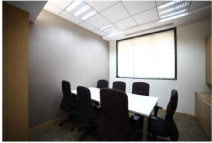
Lupin Pharma Mumbai